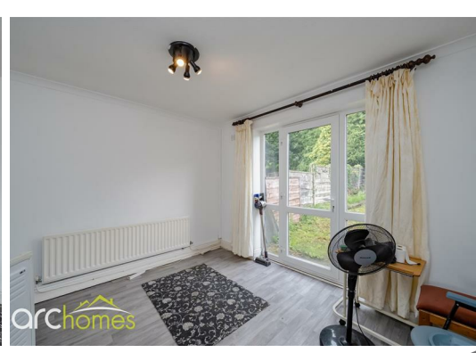
30 Bolton Old Road, Atherton, M46 9DL